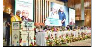
Lieutenant Governor Manoj Sinha said on Thursday that the global food system rests on women's labor, yet it excludes them from prosperity. He urged every cooperative, government stakeholder to ask, what challenge or barrier in women farmers' lives can be eliminated immediately? By removing them one by one, we can honor their leadership and enrich society and the nation through direct market access, he said. The Lieutenant Governor was speaking at the Women Farmers Conference, organised by Indian Farmers Fertiliser Cooperative Limited (IFFCO) at Srinagar. In his address, the Lieutenant Governor highlighted the contributions of women

SRINAGAR, APRIL 16: "Without women farmers, every plate would be empty, leaving humanity starved. They sustain the world, work harder than their male counterparts and their strength anchors food security, planting seeds of prosperity for families and society in every field. Under Prime Minister Narendra Modi's leadership, women's empowerment is the top priority across all sectors," the Lieutenant Governor Manoj Sinha said on Thursday. The Lieutenant Governor said that the global food system rests on women's labor, yet it excludes them from pro-