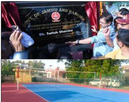
table access to the modern facilities across the rural and far-flung areas. He emphasized that sports play a crucial role in over-

Speaking on the occasion, the Minister highlighted the government's firm commitment to promote sports at the grassroots level, ensuring equi-