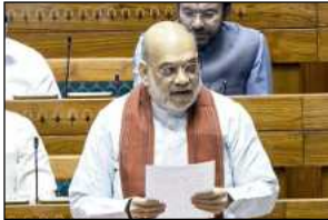
Amit Shah said on Thursday that Muslims will not be given reservation on the basis of religion as such a quota would be unconstitutional. During a fiery 40-minute debate, following which three bills were introduced in the Lok Sabha for amendment of the women's quota law and to set up a delimitation commission, Shah said a caste census will be carried out along with population enumeration during the ongoing census exercise.

NEW DELHI, APR 16: Union Home Minister Amit Shah said on Thursday that Muslims will not be given reservation on the basis of religion as such a quota would be unconstitutional. During a fiery 40-minute debate, following which three bills were introduced in the Lok Sabha for amendment of the women's quota law and to set up a delimitation commission, Shah said a caste census will be carried out along with population enumeration during the ongoing census exercise. "The question of providing reservation to Muslim women on the basis of religion does not even arise. Our Constitution does not allow at all to give reservation on the basis of religion. I want to make it clear our government's resolve that