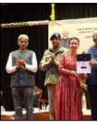
Lieutenant Governor Manoj Sinha handed over 313 job letters to district-cadre employees at a Rozgar Mela here, an official said. It was the second such fair organised within three days. On April 14, the lieutenant governor (L-G) had handed over job letters to around 200 fresh recruits in Kargil. The Leh

Autonomous Hill Development Subordinate Services Recruitment Board (LAHD-SSRB) had conducted exams to fill district cadre posts for matriculation and 10+2 level last November. A total of 387 candidates were selected, of which 313 were given appointment letters on Thursday. A majority of the new recruits have been appointed to the health, revenue, forest and animal husbandry departments, an official spokesman said.