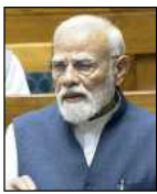
Prime Minister Narendra Modi on Thursday asserted that no state — big or small, north or south, or east or west — will be discriminated against in the delimitation of constituencies linked with the implementation of women quota law and warned that those who oppose this reform will not be forgiven by the women of the country.

NEW DELHI, APR 16: Prime Minister Narendra Modi on Thursday asserted that no state — big or small, north or south, or east or west — will be discriminated against in the delimitation of constituencies linked with the implementation of women quota law and warned that those who oppose this reform will not be forgiven by the women of the country. Intervening the debate in Lok Sabha on the three bills introduced for amendment of the women's quota law and to set up a delimitation commission, Modi also made it clear that the